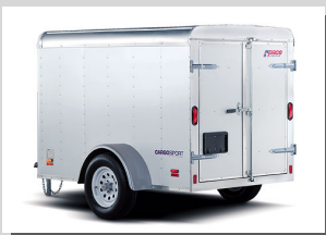
Single axle model shown.