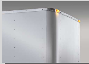
High quality 12v exterior lighting.