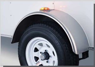
Smooth Aluminum fenders are attractive and durable