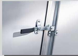
Heavy-duty zinc plated barlocks assure your cargo can be safely locked.