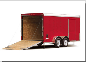
Standard heavy-duty rear ramp door.