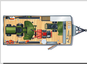
All-steel frame is designed and built to last. Pace knows quality.